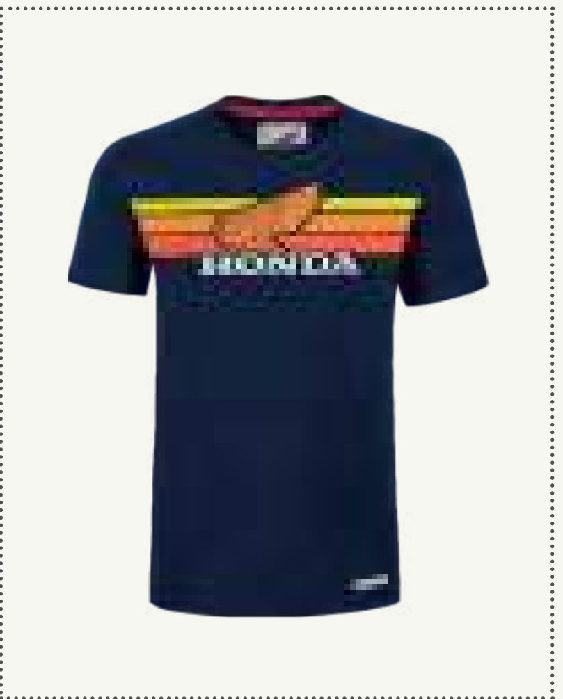
SUNSET NAVY BLUE T-SHIRT