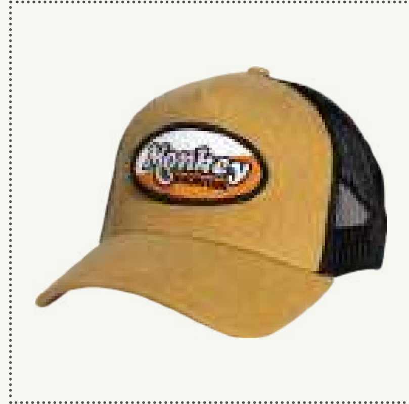
MONKEY TRUCKER CAP