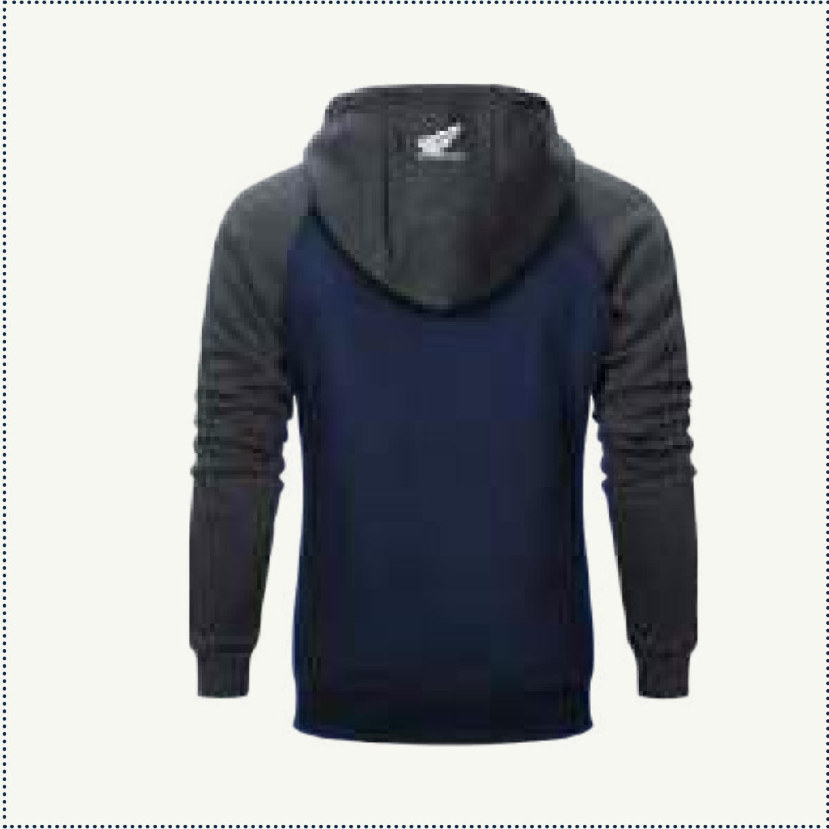
BLUE/GREY HOODIE 54€

MATERIAL 80% COTTON / 20% POLYESTER - 300 GSM SIZES XS | S | M | L | XL | XXL CODE 08AUD-KHO-0046