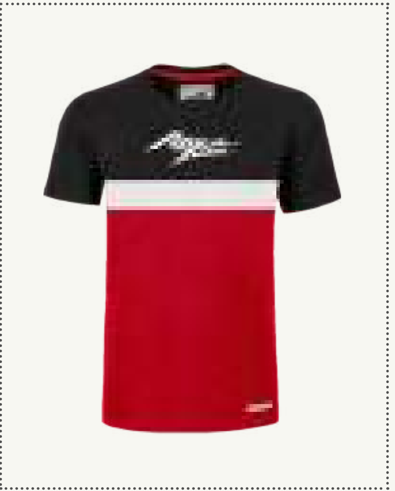
AFRICA TWIN T-SHIRT