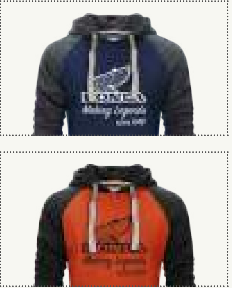
MAKING LEGENDS HOODIES