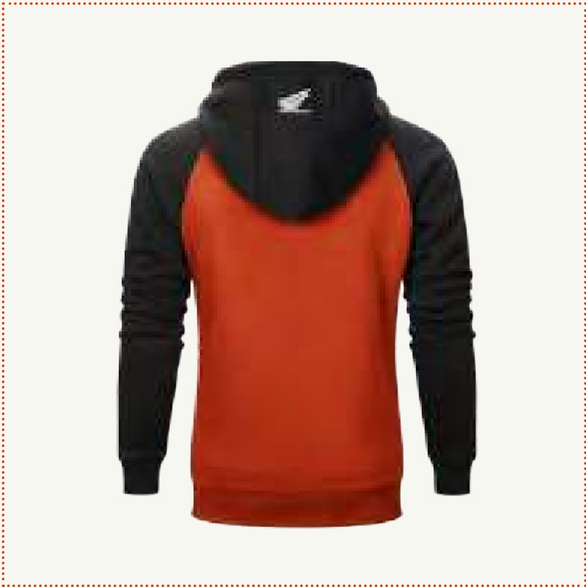
ORANGE HOODIE 54€

MATERIAL 80% COTTON / 20% POLYESTER - 300 GSM SIZES XS | S | M | L | XL | XXL CODE 08AUD-KHO-0030