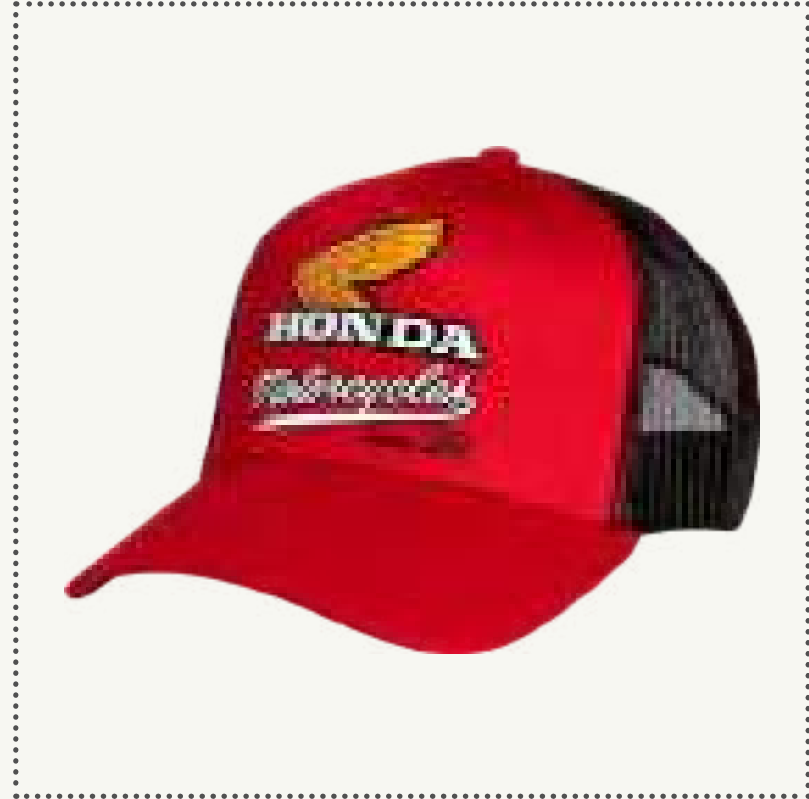
ELSINORE TRUCKER CAP