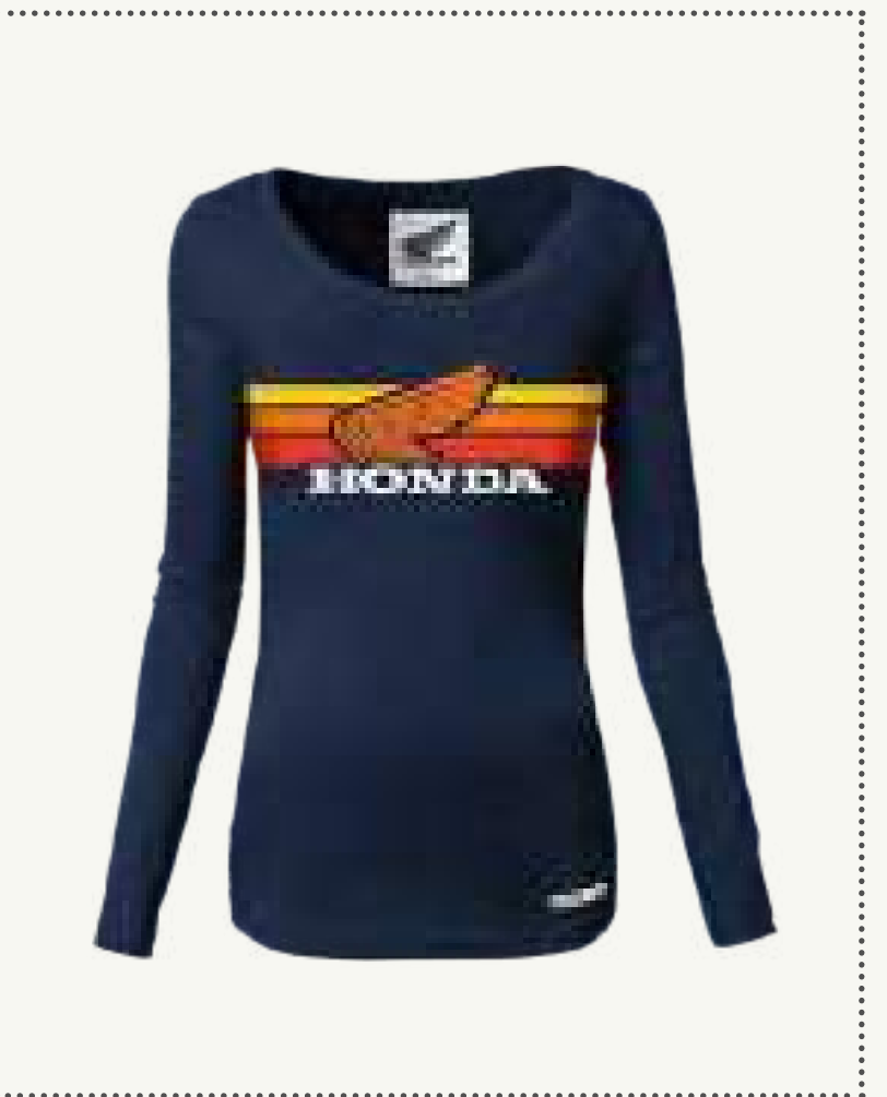
LADY SUNSET T-SHIRT