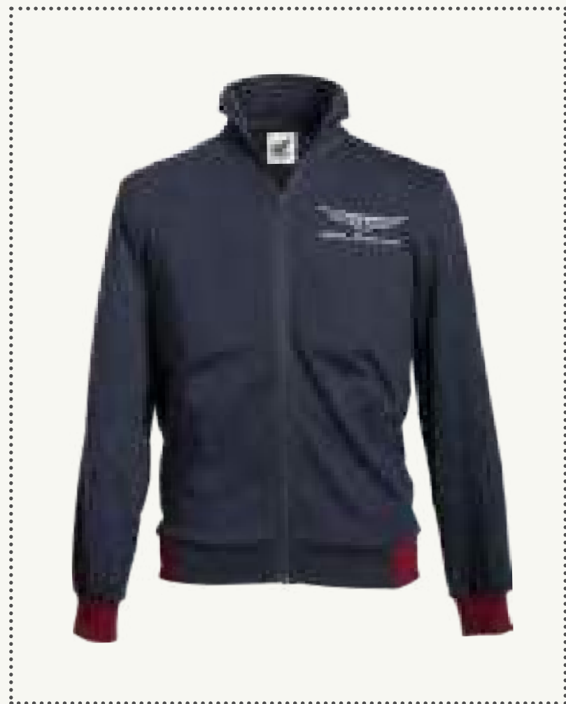
GOLD WING FULL ZIP