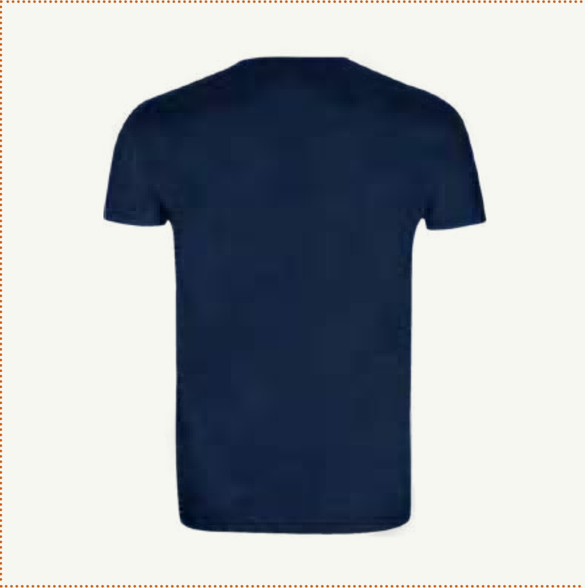
NAVY BLUE T-SHIRT 22€

MATERIAL 100% COTTON - 200 GSM SIZES XS | S | M | L | XL | XXL CODE 08HOV-T18-3