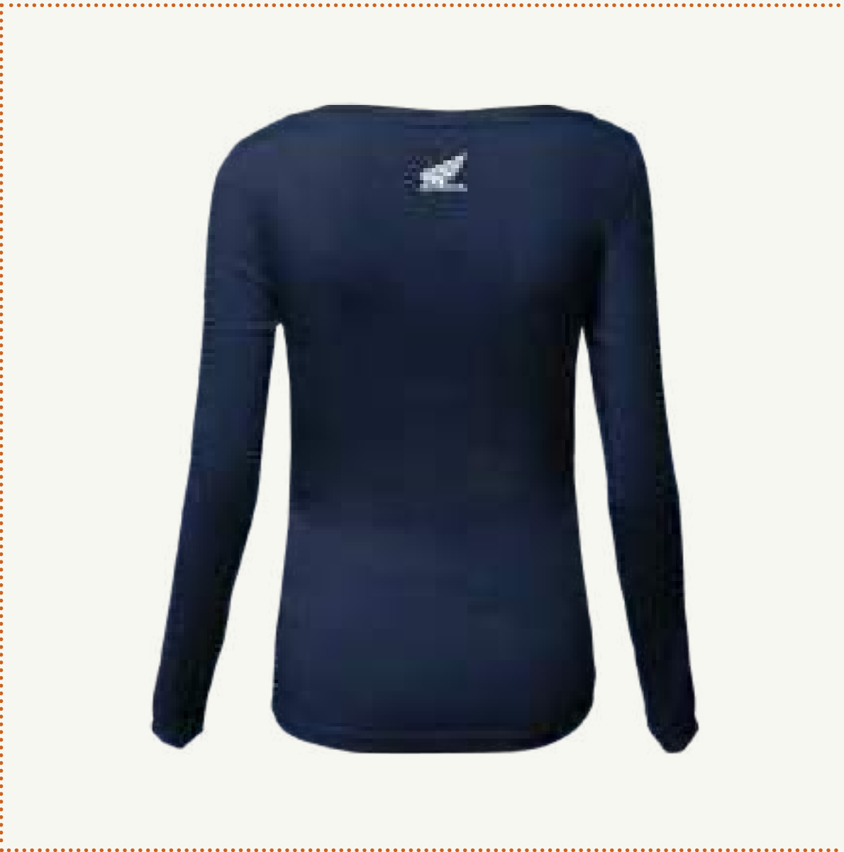
LADY T-SHIRT 25€

MATERIAL 100% COTTON - 200 GSM SIZES XS | S | M | L | XL | XXL CODE 08AUD-KWO-001B