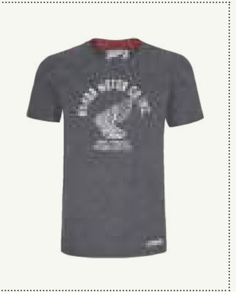
TECHNICAL RESEARCH T-SHIRT